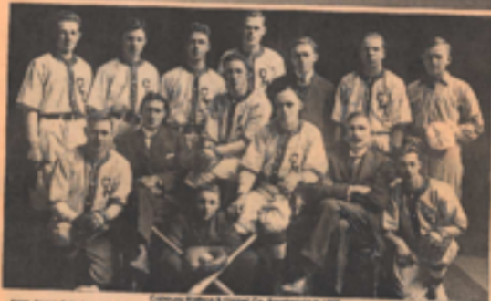
Cobourg Minor League Baseball Team