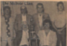
The McIvor Clan