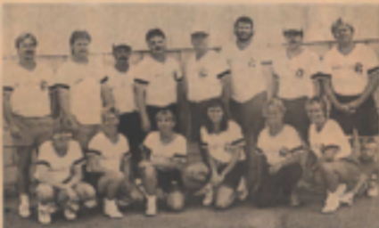
Home Plate sits with the 14 Championship of the Coburg Mixed Lob Ball League every year since 1991.