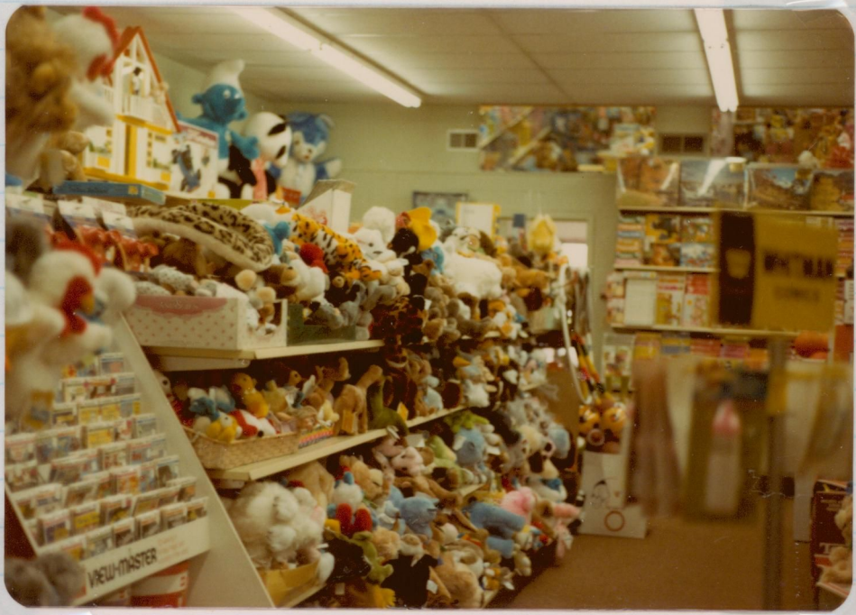
THE TOY SHOP