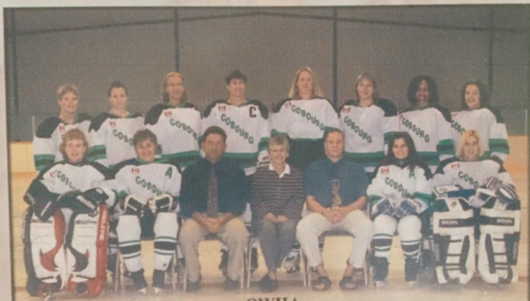
OWHA Eagle.ca Senior "B" 2001-2002