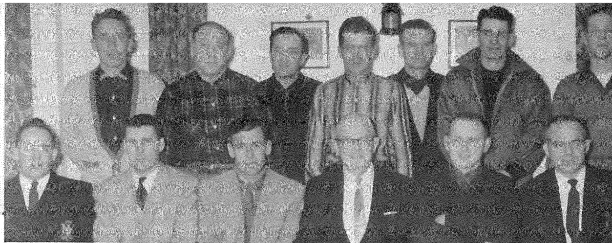
COBOURG CHURCH LEAGUE EXECUTIVE 1960 - 61

These rules were made to help each player develop keen sportsmanship and healthy bodies. It is the moral responsibility of not only the team executive but also each parent to see that his boy is penalized when any of the above rules are broken.